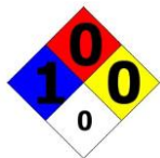
NFPA SCALE (0-4)

A trade secret is being claimed for a specific chemical identity and exact percentages. Other Non-GHS Classification: